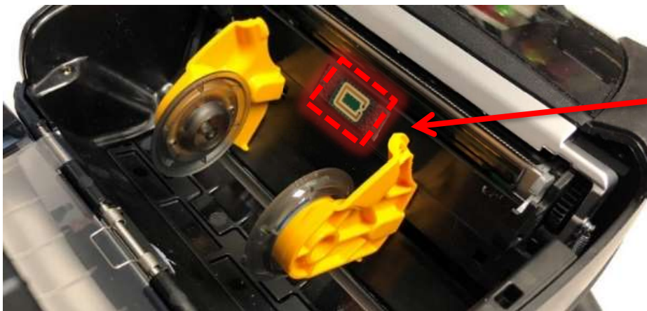
Approximate location of RFID Encode Zone